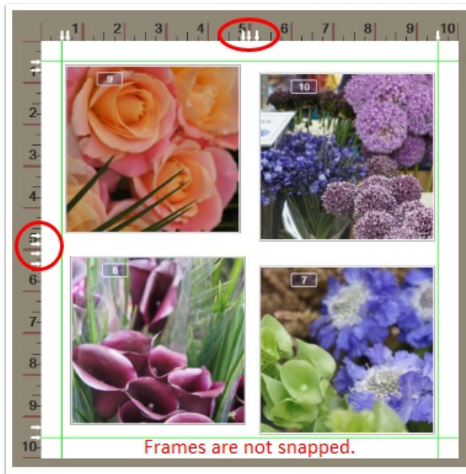
Image frames are, by default, magnetic. Two adjacent frames will pull together magnetically when being moved on the canvas, and will snap together. Frames that are snapped together will share a snap line on the ruler bar.